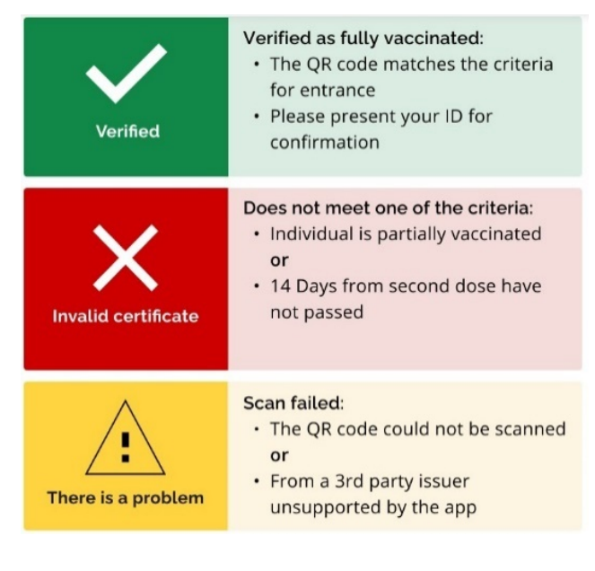
Figure 1: Verify Ontario scan results (exact wording may vary)

In the case of 2 and 3, the patron may NOT enter the premises, unless an alternative proof of vaccination can be provided (i.e., the PDF version in electronic or paper formats). The app provides guidance on how to assist the patron with the issue.