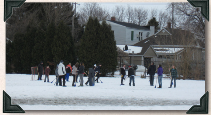
The Wellness Council here enjoyed teaching their peers new sports and games from other countries at a cultural sports day.