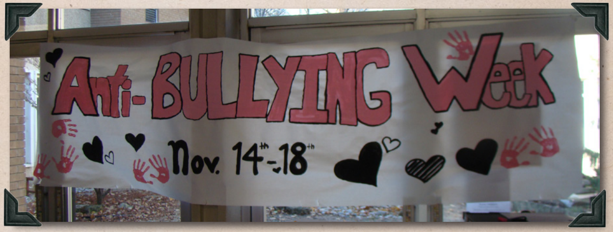
Local high school students take a pledge to stop bullying during an Anti-Bullying Week organized by the school Wellness Council.

A group of students in a Wellness Council noticed that their peers were beginning to drink energy drinks. They planned an assembly and presented a skit they created featuring the harmful effects of these drinks. The Wellness Council organized a Rethink your Drink challenge between classrooms: they counted the number of healthy and unhealthy drinks in each class at lunchtime. The winning classroom played a dodge ball game against "Crash," a human-size energy drink!