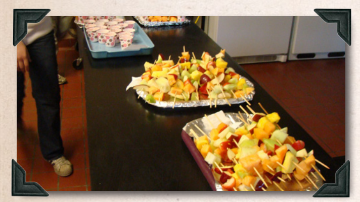
Students from a local elementary school made and sold fruit kabobs as a fundraiser for their Wellness Council.