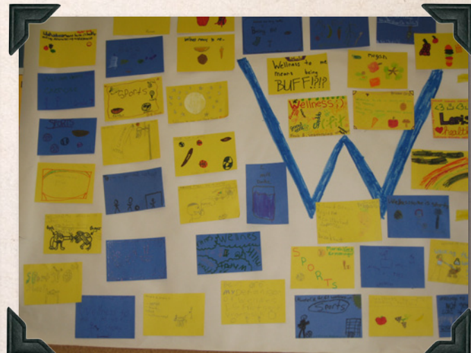
One Wellness Council found out what their school thought about "Wellness" by creating this poster in the gym.